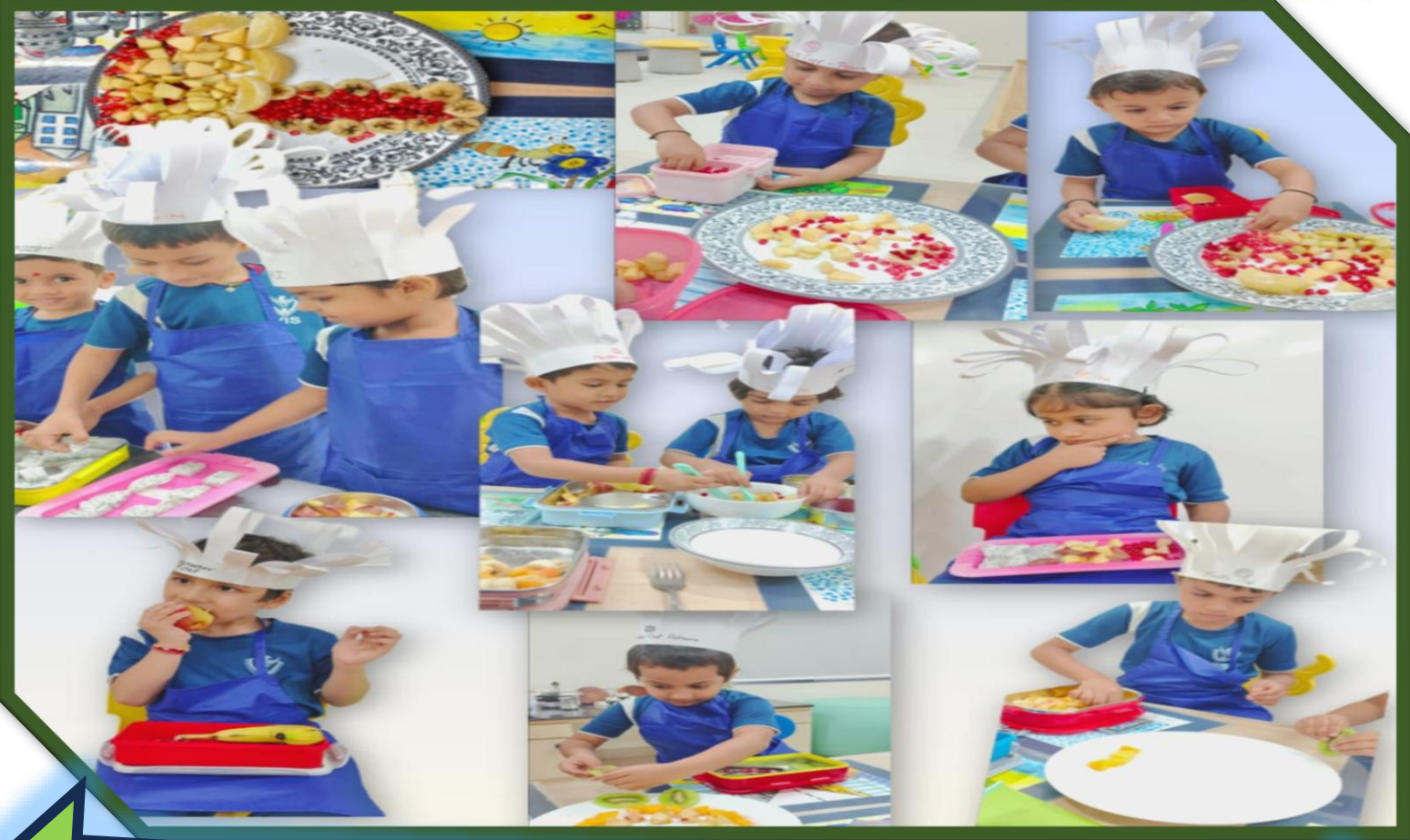
Fruit-tastic Fun Our Little Chef's happy faces and their delicious fruit salads!