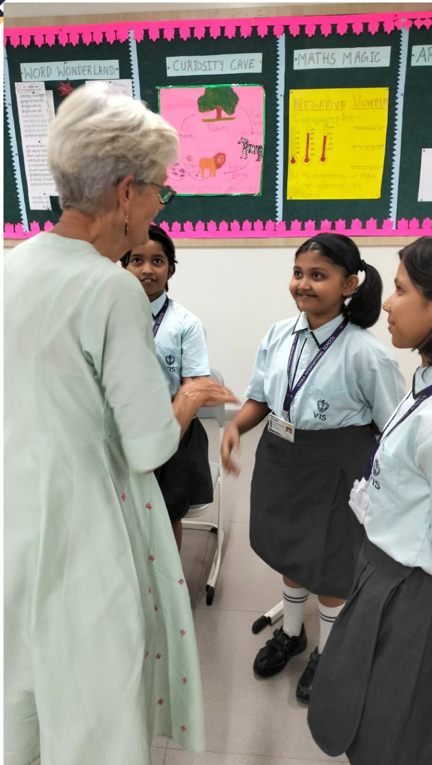
READING QUOTES IN TURNS