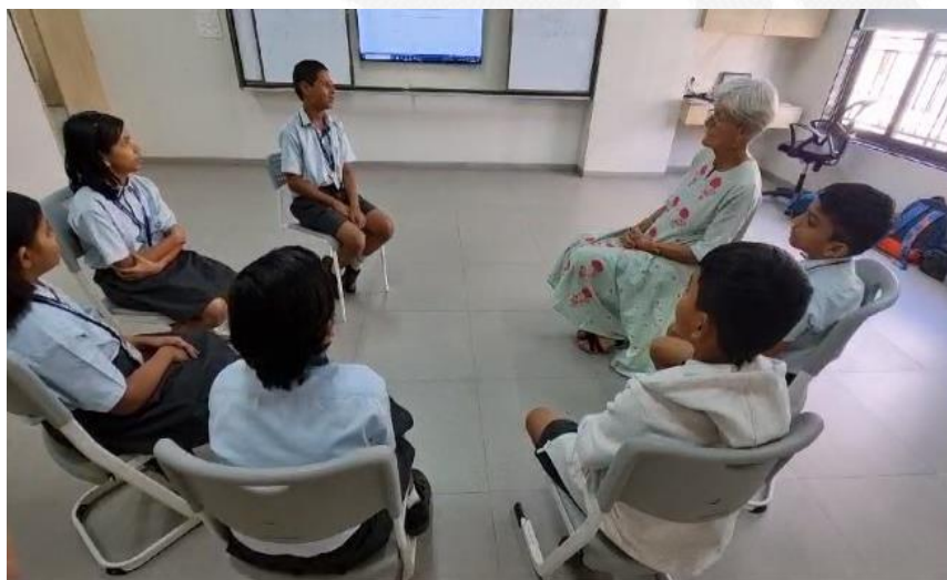
DISCUSSING BOOKS IN CIRCLES