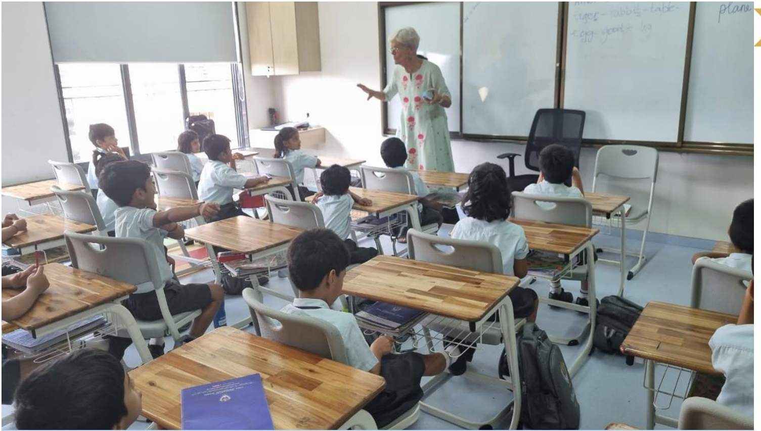
QUESTION AND ANSWER